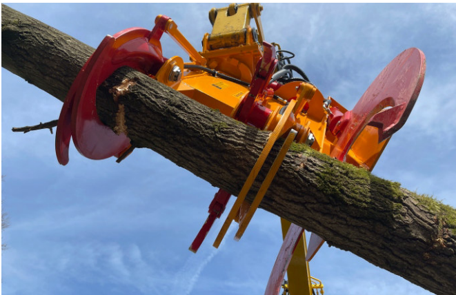
Schnitt-Griffy HS 960 SE+ in gripper mode