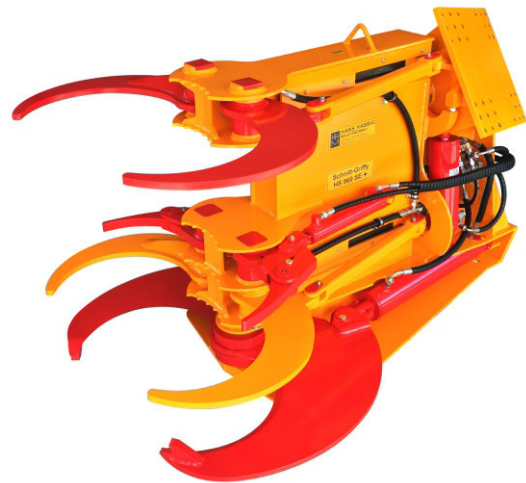
Schnitt-Griffy HS 960 SE+