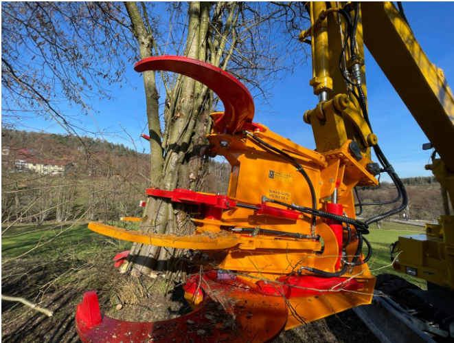
Schnitt-Griffy HS 960 SE+ in action