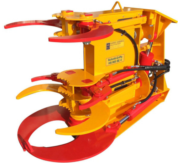
Schnitt-Griffy HS 865 SE+