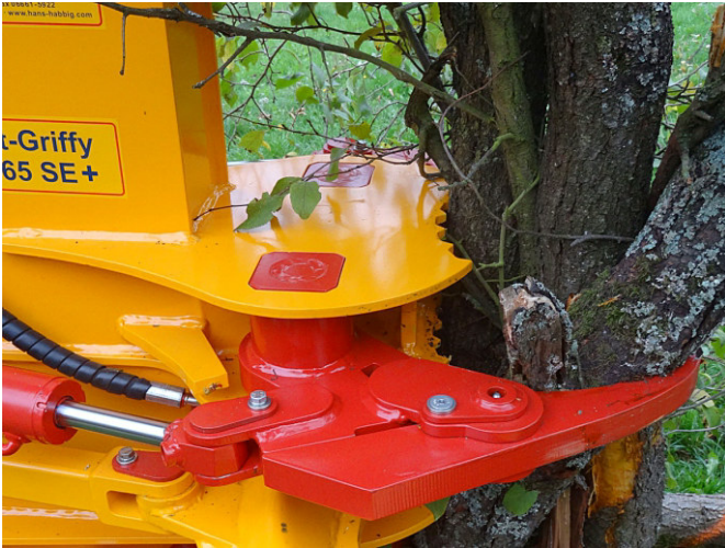
Schnitt-Griffy HS 865 SE+ in action